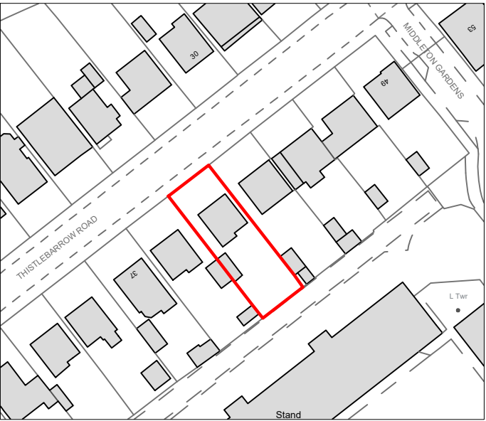
Proposed Location Plan Scale 1:1250